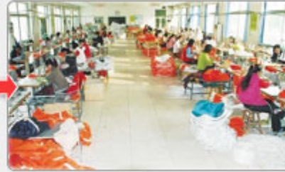
3. Special Sewing Workshop