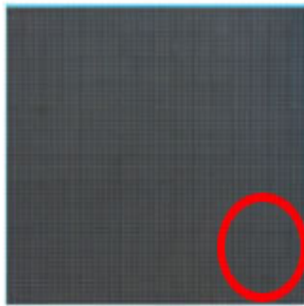
Name:Lnk-ID4-RGB-16l Size: 512mm×384mm×120mm