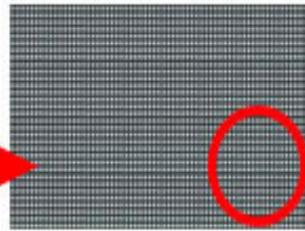
Size: 256mm×128mm Resolution: 64×32