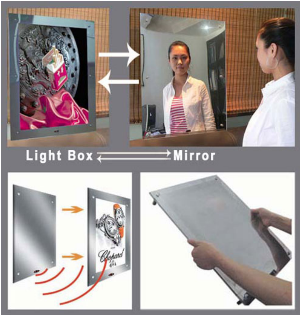
Light Box ← → Mirror