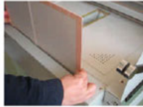
Electric edge folder Adjustment for pressure of edge folder