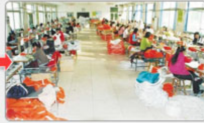
3. Special Sewing Workshop