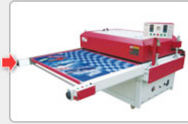
2. Heat Press Transfer