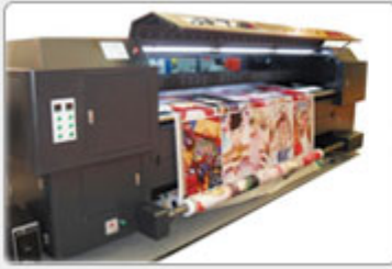
1. Large Format Printing