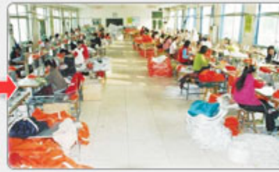
3. Special Sewing Workshop