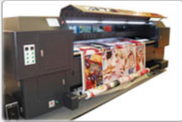
1. Large Format Printing