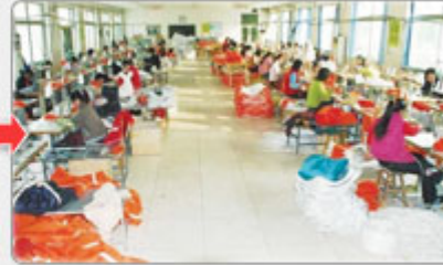
3. Special Sewing Workshop