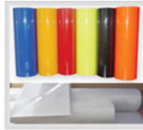
Heat Transfer Paper\Film