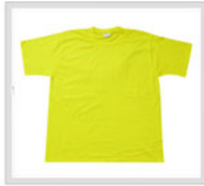
Heat Transfer Blanks