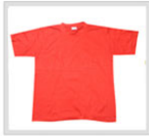
Heat Transfer Blanks