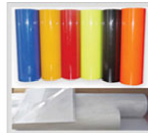
Heat Transfer Paper\Film